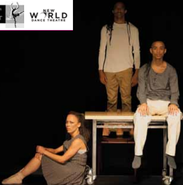
When they Leave: Kirvan Fortuin